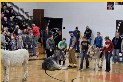
Bloomer FFA Donkey Basketball