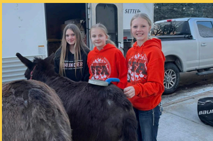
Osseo-Fairchild FFA Donkey Basketball