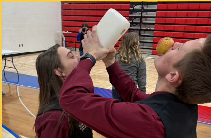
G-E-T FFA Ag Olympics and Pancake Breakfast