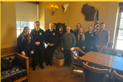
Day on the Hill

I travelled hundreds of miles across the state to join FFA members in all kinds of events! Here are some notable moments: