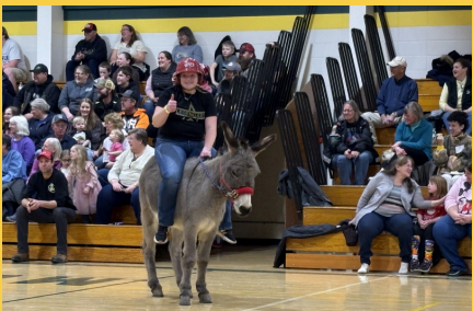
Melrose-Mindoro FFA Donkey Basketball