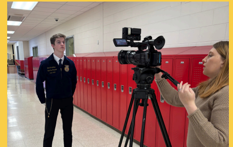
Chippewa Falls FFA Teacher Appreciation Breakfast