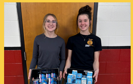
Elmwood FFA Pancake Breakfast