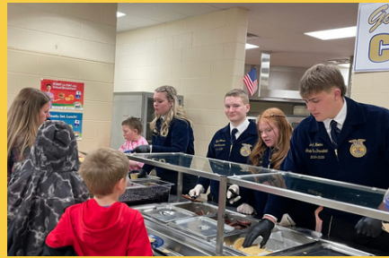
Mauston FFA Pancake Dinner