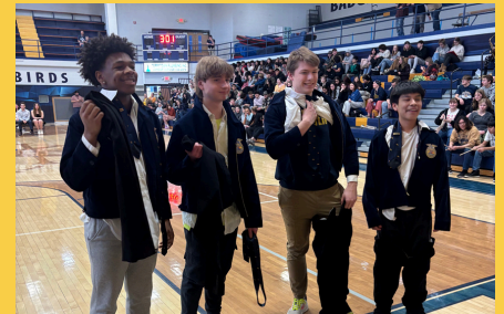
Baraboo FFA Assembly