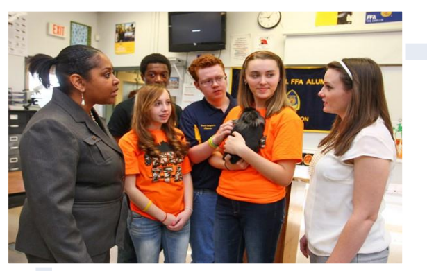
Growing Leaders, Building Communities, Strengthening Agriculture

"We make a living by what we get; we make a life by what we give."