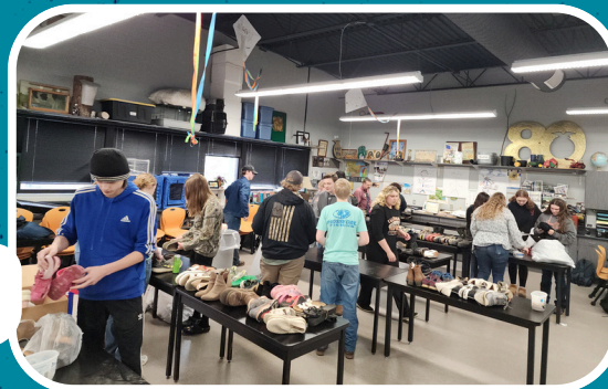
River Valley Pancake Breakfast