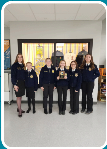
Quiz Bowl Viroqua