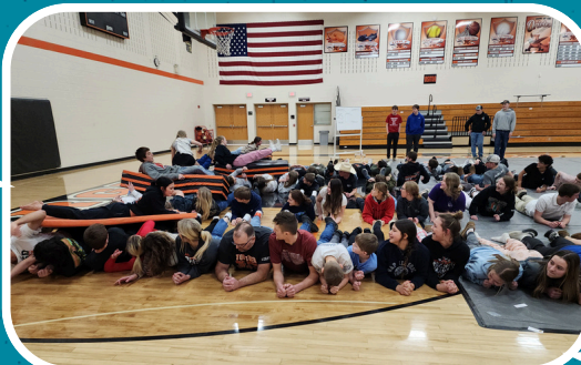
Argyle Ag Olympics