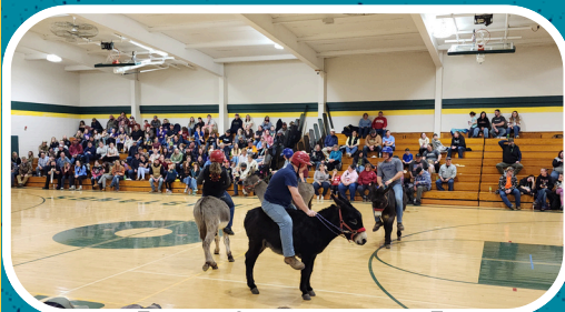
Mel-Min Donkey Basketball