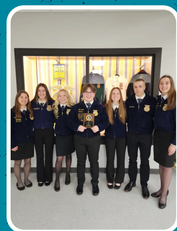
Parliamentary Procedure C-FC

These individuals placed First at the Sectional level and will compete at the State level in June!