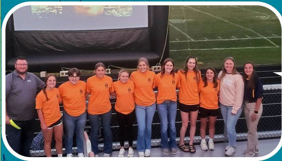
C-FC Movie Night