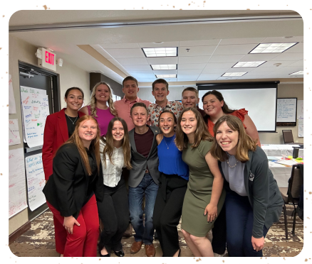
Base Camp Training and Checkpoint #1.

Right after state convention, the team traveled to Marshfield for Base Camp, to learn about team dynamics and more! The team traveled back to Marshfield later in the summer to continue our training in speech and workshop development!