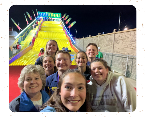
Wisconsin State Fair

Right after state convention, the team traveled to Marshfield for Base Camp, to learn about team dynamics and more! The team traveled back to Marshfield later in the summer to continue our training in speech and workshop development!