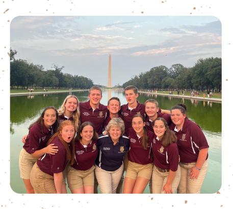
State Officer Summit

At Farm Technology days, we worked a safety booth, teaching about grain bin, ATV/UTV, and underground utilities safety! We visited with FFA sponsors, networked with industry leaders, and enjoyed playing volleyball as a team-in our free time!