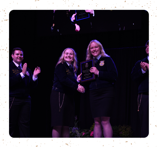
Food For America 1st Place Winner Elkhorn FFA