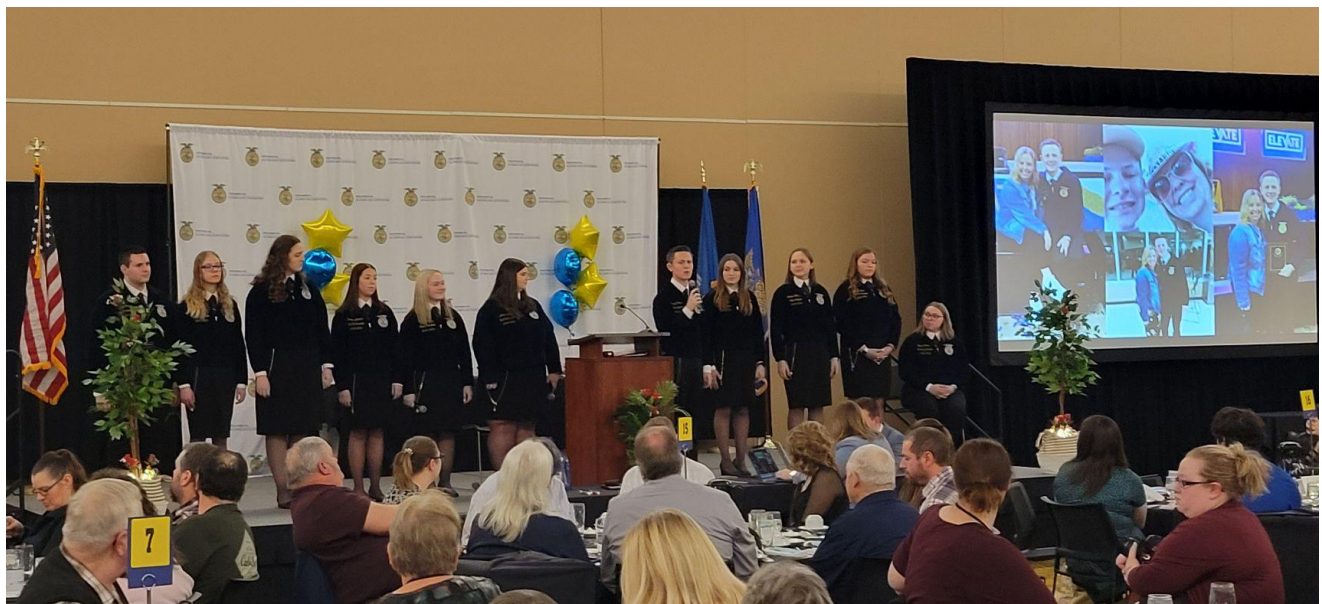
State FFA Officer Reflections Program