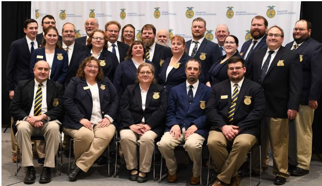
2024-2025 Wisconsin FFA Alumni & Supporters Council