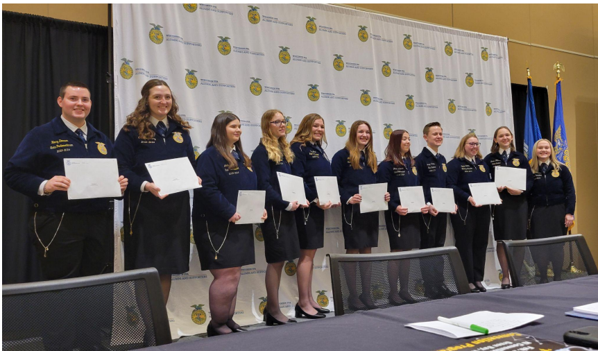
State Officers Become Lifetime Members