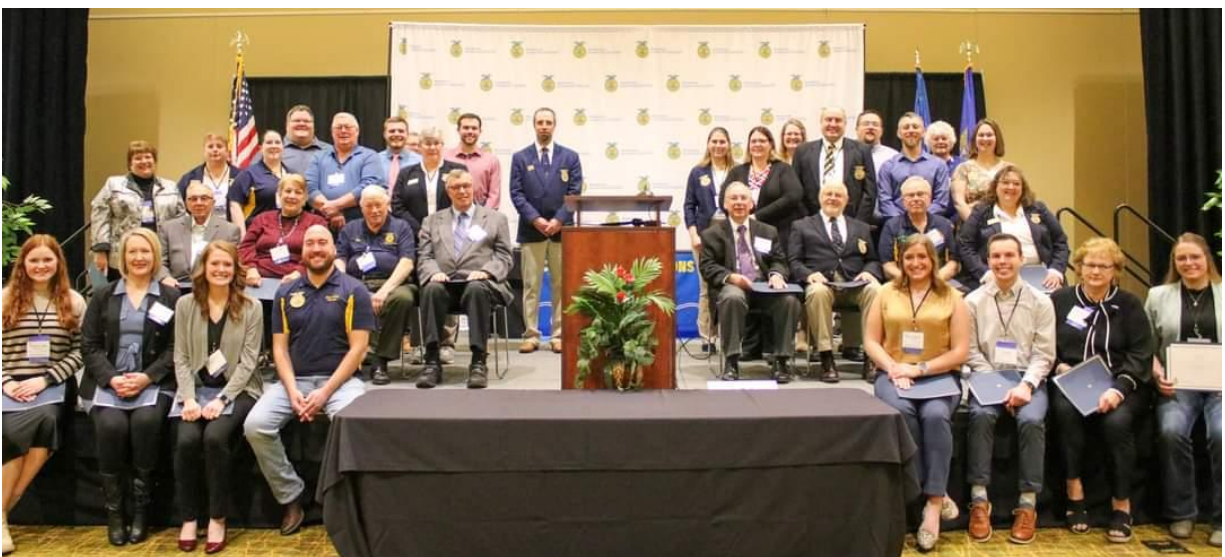
Wisconsin FFA and FFA Alumni & Supporters Past Leaders